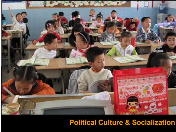
Political Culture & Socialization